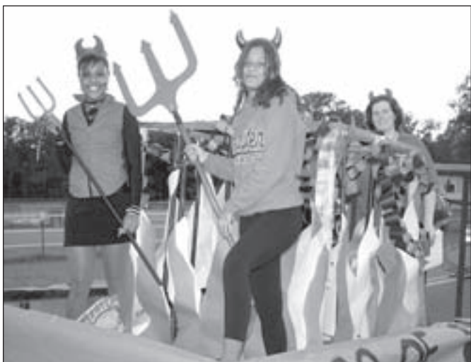
The junior class float was fired up with Red Devils ready to defeat the Washington and Lee Eagles.