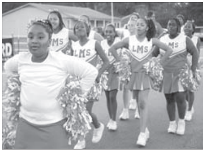
Spirited Lancaster Middle School cheerleaders cheered on the Red Devils during Lancaster High School's Homecoming Parade before Friday night's game.