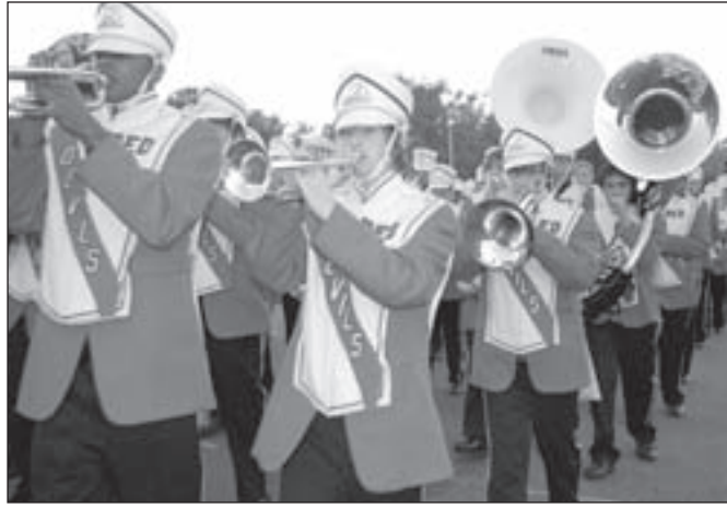
The highlight of the parade was the award-winning LHS Marching Red Devils Band. With 199 members, the band takes a big bite out of the 485 total school enrollment.