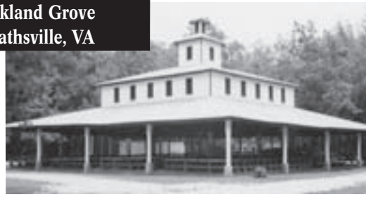
Kirkland Grove Heathsville, VA

Halloween did not grow out of evil practices, though some dark cults may have adopted Halloween as their favorite holiday. It grew out of the rituals of Celts celebrating a new year, and out of Medieval European prayer rituals. Today many churches have Halloween parties or pumpkin carving events for the kids. After all, the day itself is only as evil as one cares to make it.