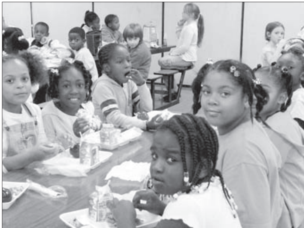
Third-graders enjoy baked chicken and pizza.

there is "no room for error" because the snow days or other significant unplanned school closures affect the bottom line with Aramark.