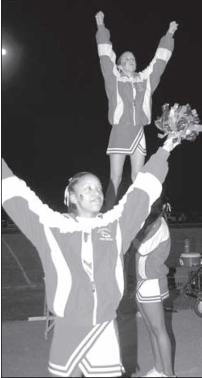
Entertaining the crowd, Lancaster High's varsity cheerleaders did a lift during a break in the action on the field.