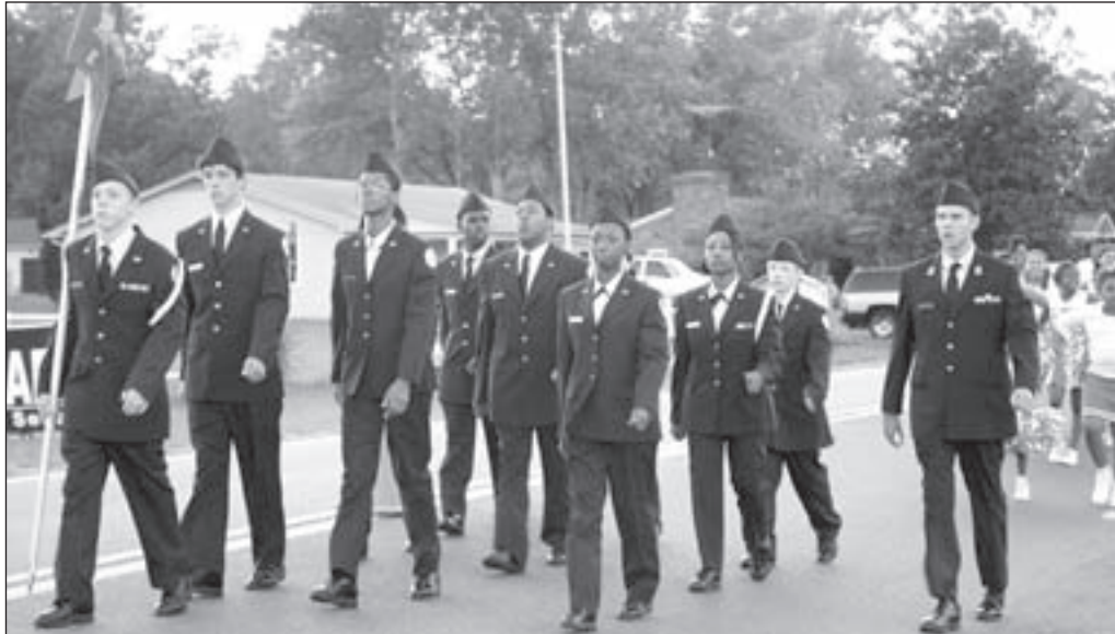
Following the nominees for Homecoming Queen and King in the parade, LHS's Air Force Junior ROTC display the colors. Members are in the 9th through 12th grades.