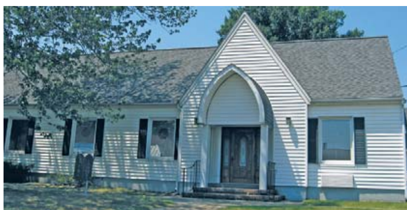
Seventh Day Adventist, Kilmarnock