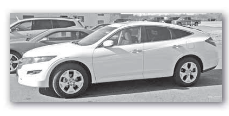
2012 Honda Crosstour EX-L , 3.5L Liters- 6 cylinders, automatic. White - 2,276 mileage. 1 Owner. 5,000 guaranteed trade. $35,995 Stock #N19580A Northern Neck Chevrolet 804-493-8901 • www.nncp.com