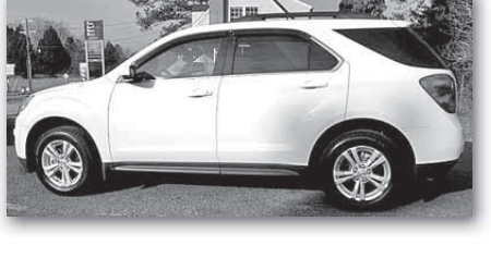
2011 Chevrolet Equinox 6 speed automatic, 2.4L Liters, 1-4 cylinders, 15,565 miles, $26,450, Stock #14142 Callao Car Center 804-529-6969 www.CallaoCarCenter.com