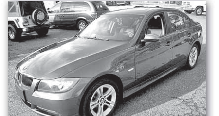
2008 BMW 328i 6 speed automatic, 3.0L Liters, 1-6 cylinders $21,995 Callao Car Center 804-529-6969 Stock Trade #1028 • www.CallaoCarCenter.com