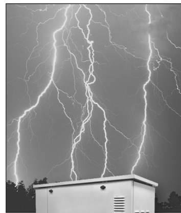
Models Available: 7kw - 150 kw

GUARDIAN GENERATOR by Generac Power Systems, Inc. Installation & Service