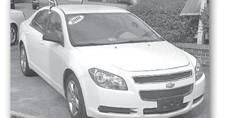
2010 Chevrolet Malibu 4 other Malibu's available. Low mileage. Stock # 3718. Priced from $14,900-$16,900. Arcadia Motors 804-580-2277 www.arcadiamotorsinc.com