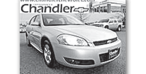
2011 Impala LT Program Car 1/2 off original MSRP $25,990. Our price $12,995 plus $482. Procurement & shipping charge. No processing fee. Tax & registration fee not included. Stock # 18569 10 available. Chandler Chevrolet 804-443-5100 .