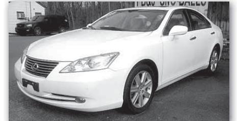
2008 Lexus ES350 w/Nav. Auto, all power, heated seats, sunroof, park assist, track control, too many options to list. *clean carfax-one owner 44,000 miles. $23,900. Stock #3711 Arcadia Motors 804-580-2277 804-450-5008 • www.arcadiamotorsinc.com