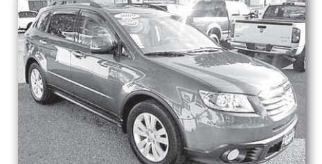
2009 Subaru Tribeca-Maroon . 5 speed automatic. 3.6L Liters. 6 cylinders. $26,250. Stock #14224 Callao Car Center 804-529-6969 www.CallaoCarCenter.com