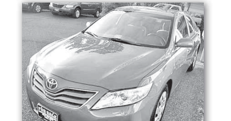
2011 Toyota Camry-Red , 6 speed automatic. 2.5L Liters, 4 cylinder. $18,550 Stock # 14167A Callao Car Center 804-529-6969 www.CallaoCarCenter.com